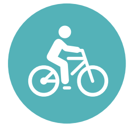
Fun and Recreation

This year's Expo will offer live tours, workshops, speakers, giveaways, live chat sessions with our vendors, and much more. We are currently planning: