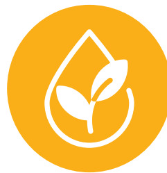
Food and Farming